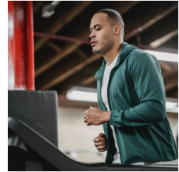
Aerobic Exercise Program Reduces Musculoskeletal Pain and Fatigue in Psoriasis Subjects without Psoriatic Arthritis