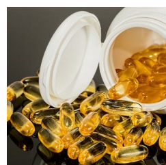
Effect of Omega-3's and Vitamin E on Inflammation, Insulin and Lipids in Parkinson's Disease