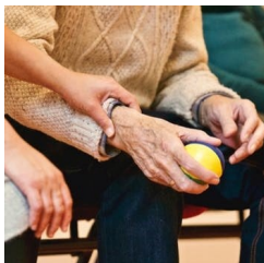
N-Acetyl Cysteine Improves Symptoms of Parkinson's Disease

It is always recommended to speak with your primary treating doctor and obtain his/her recommendation before beginning a new health regimen.