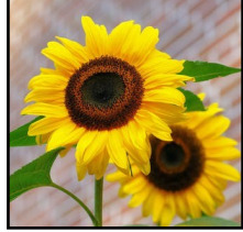
Sunflower Seed Extract Improves Body Weight, Fat Mass, and Lipid Profile in Obese Subjects