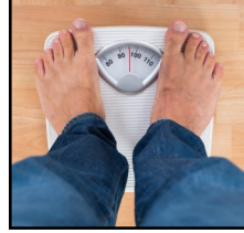
Paprika Xanthophylls Significantly Reduces Abdominal Fat in Overweight Individuals

There are many effective, natural methods to help with your weight loss efforts. By adding the simple suggestions below, as well as moderate and consistent physical activity, you not only have the chance to lose weight, but also live a healthier lifestyle.