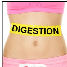
Gut Feelings, Tummy Matters