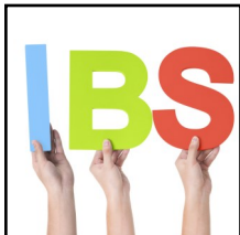
Lifestyle Changes Can Bring a Bowel Back into Balance