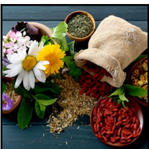
Herb Butterbur May Be Allergy Alternative