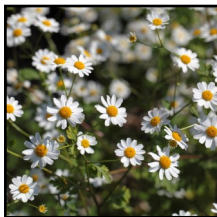
Allergies: Natural Relief