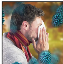
Allergic Rhinitis and Spirulina