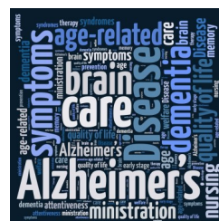
Reduced Non-Rapid Eye Movement Sleep is Associated with Early Alzheimer's Disease