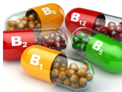
B Vitamin Supplementation Improves Overall Cognitive Functioning in Non-Aspirin Users

The first symptoms of Alzheimer's vary from person to person. Memory problems are typically one of the first signs of cognitive impairment related to Alzheimer's disease. Other early signs are: difficulty completing familiar tasks, challenges in planning or solving problems, confusion with time or place, problems with words in writing or speaking, lapse in judgment, mood changes and social withdrawal. If you recognize any warning signs in yourself or a loved one, consult a physician. Early diagnosis of Alzheimer's disease or other disorders causing dementia is an important step in getting appropriate treatment, care, and support services.