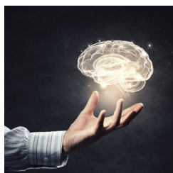
Chi311/YKL-40 Controls Astrocyte Circadian Clock and Alzheimer's Disease Progression