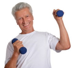
Prolonged Sitting with Interrupted Activity Improves Vascular Function in Type 2 Diabetics