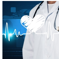
Omega-3 Fatty Acids Improve Indices of Vascular Stiffness in Men with Abdominal Aortic Aneurysm