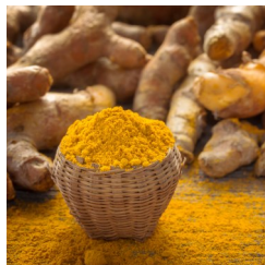
Curcumin Improves Vascular Endothelial Function in Healthy Older Adults