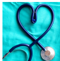
L-Carnitine Improves Oxidative Stress in Coronary Artery Disease Patients