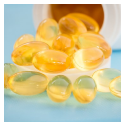
Fish Oil Supplementation and the Risk of Coronary Artery Disease in Diabetics and Prediabetics