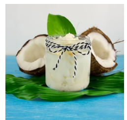
Coconut Oil Improves Cholesterol and Weight in Patients with Coronary Artery Disease