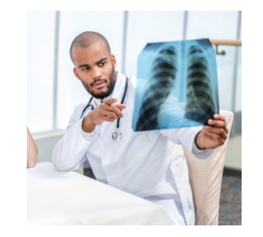
Long-Term Air Pollution Linked to Emphysema and Lung Function