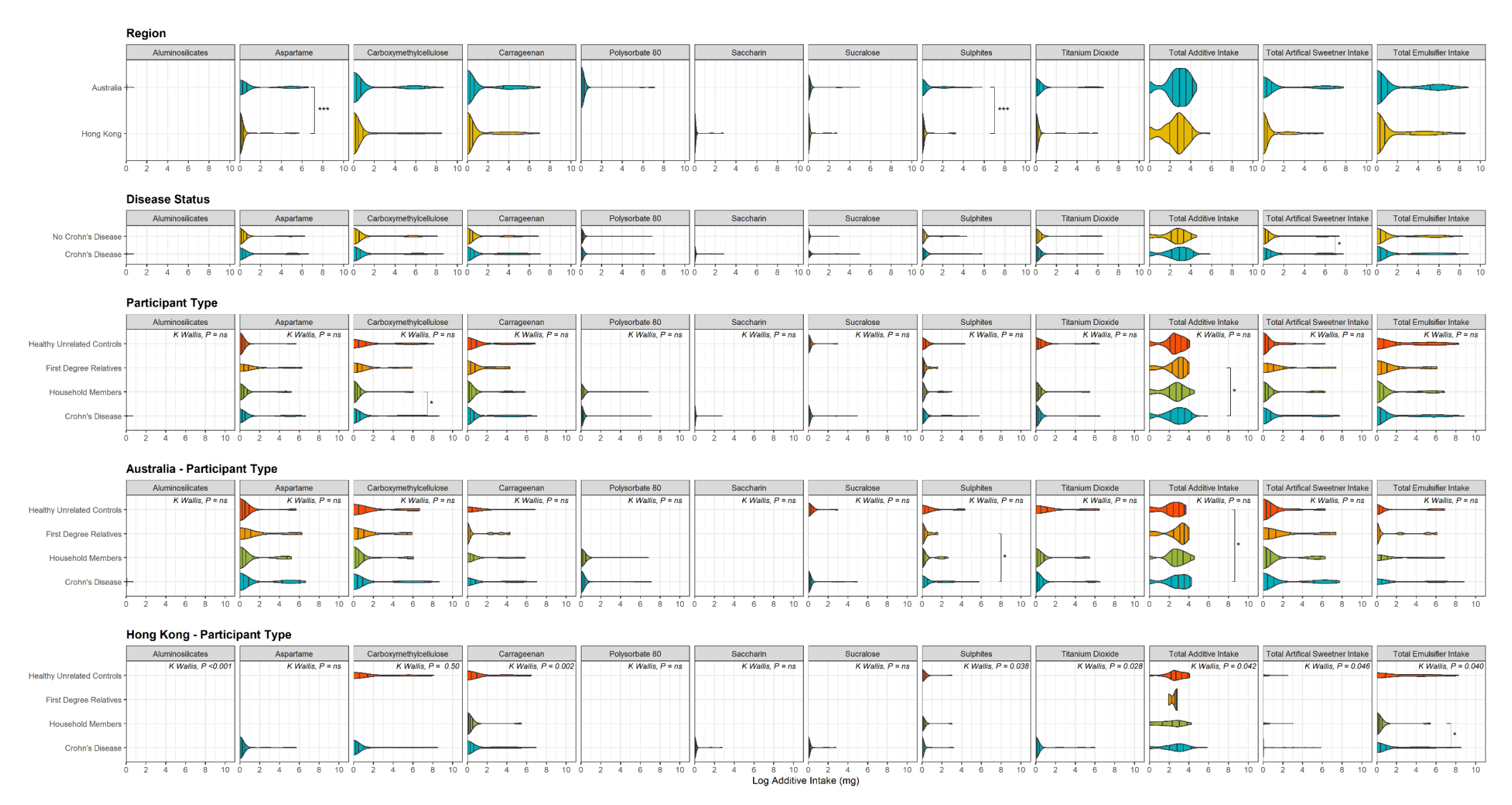
Figure 2. Violin plots showing the distribution of Log-adjusted median additive intake (in milligrams) across additives of interest (as well as total additive intake, total artificial sweetener intake and total emulsifier intake, far right panels) from current (last 3 days) intake questionnaire: between regions (top panel), for Crohn's cases compared to all controls (Disease Status; second panel), between all participant types across both regions (third panel), and between all participant