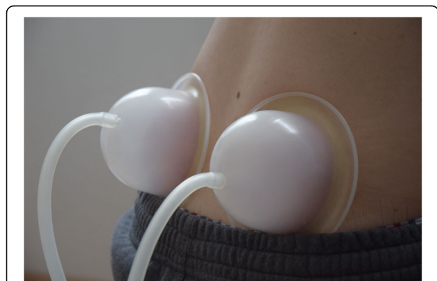
Fig. 1 Application of the silicone cups at the low back area

Participants randomized to the minimal cupping group received 8 cupping sessions (each 8 min) in 4 weeks with a HeVaTech PST 30 pulsatile cupping device, also with two silicone cups and a weaker negative pressure around -70 mbar and suction intervals of 2 s. In addition,